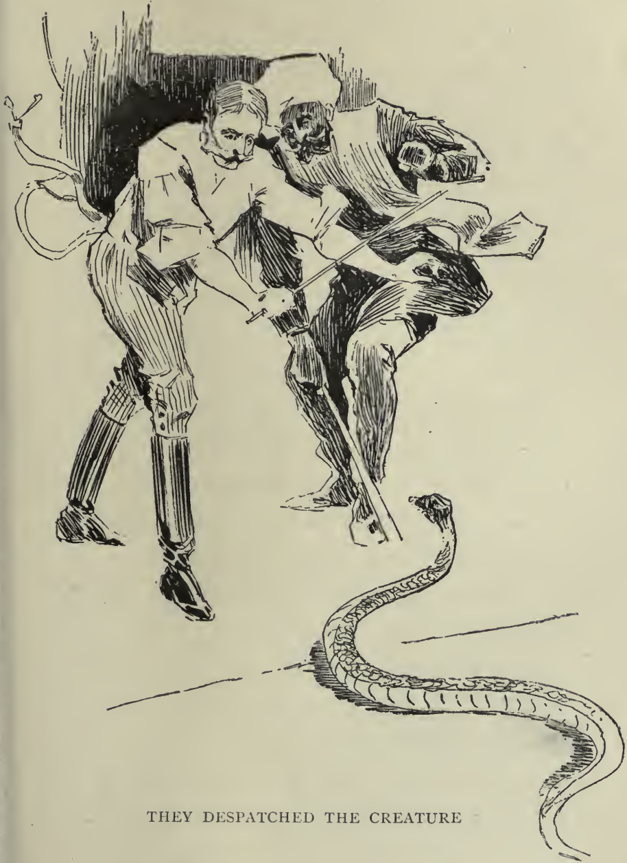
THEY DESPATCHED THE CREATURE